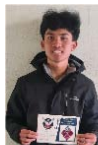
Elton Eclipse Year 10