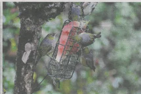
Tasty delights . . . Silvereyes feast on slices of melon in a Fernside garden.