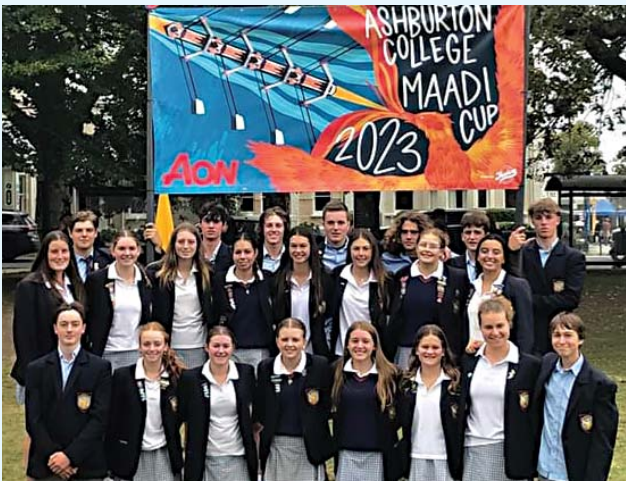
(Pictured above): The College team at the AON Maadi Cup Opening Parade, of approximately 2000 competitors, on Sunday 26 March.