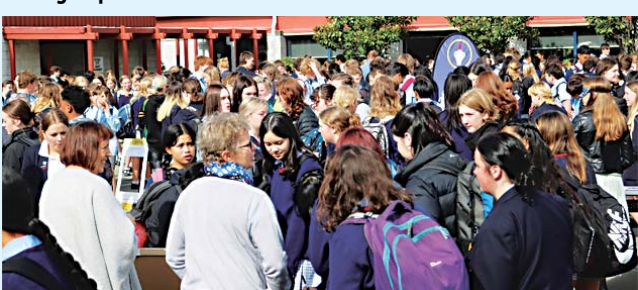
(Pictured above): Students surrounding the various stalls.

Following a weather delay for the scheduled day of 22 February, this morning was held on Tuesday 07 March, with an impressive fifty displays showcased on the Chessboard.