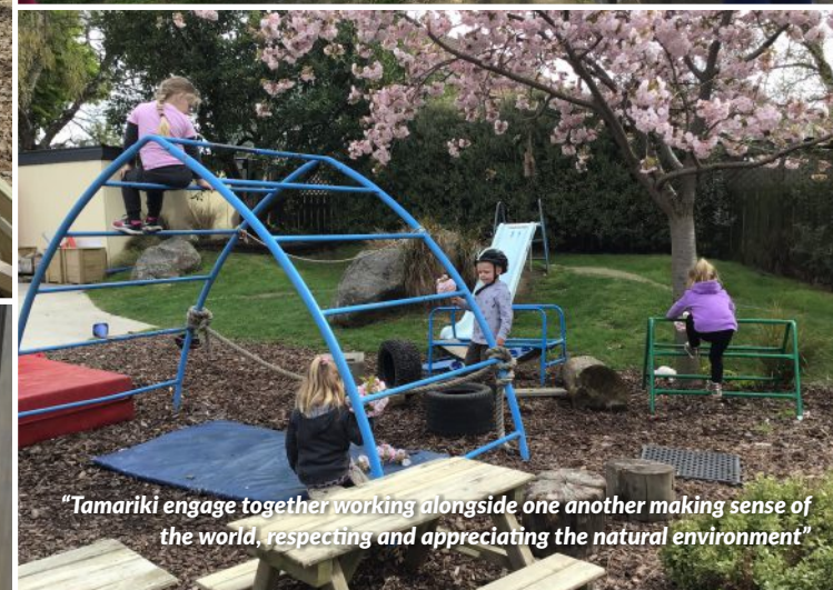
"Tamariki engage together working alongside one another making sense of the world, respecting and appreciating the natural environment"