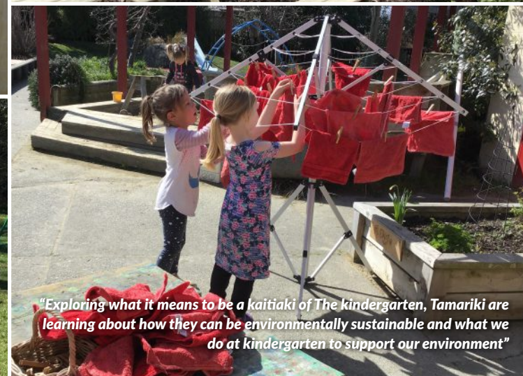
"Exploring what it means to be a kaitiaki of The kindergarten, Tamariki are learning about how they can be environmentally sustainable and what we do at kindergarten to support our environment"