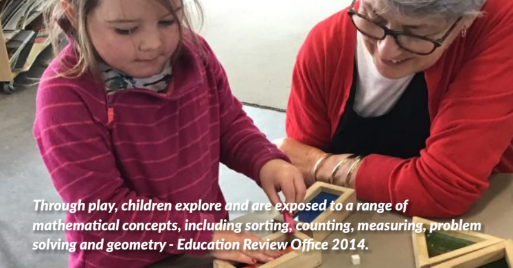
Through play, children explore and are exposed to a range of mathematical concepts, including sorting, counting, measuring, problem solving and geometry - Education Review Office 2014.