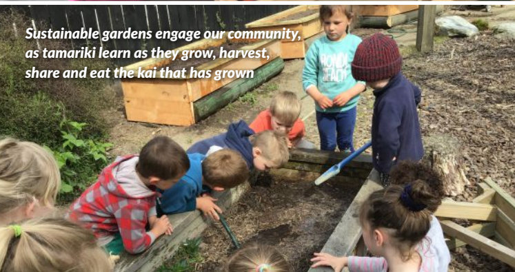
Sustainable gardens engage our community, as tamariki learn as they grow, harvest, share and eat the kai that has grown