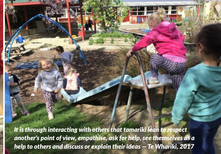
It is through interacting with others that tamariki learn to respect another's point of view, empathise, ask for help, see themselves as a help to others and discuss or explain their ideas – Te Whariki, 2017