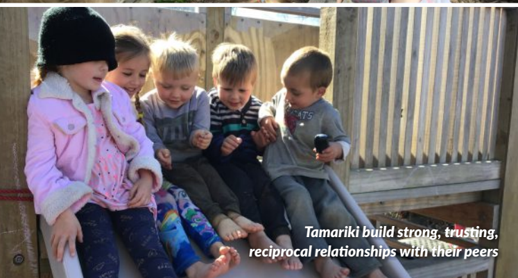
Tamariki build strong, trusting, reciprocal relationships with their peers