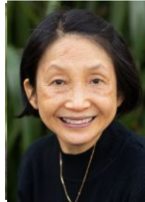
Navy (Teaching Aide)