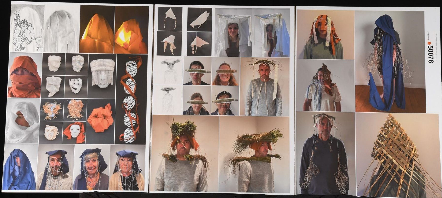
L3 Sculpture NZQA exemplar