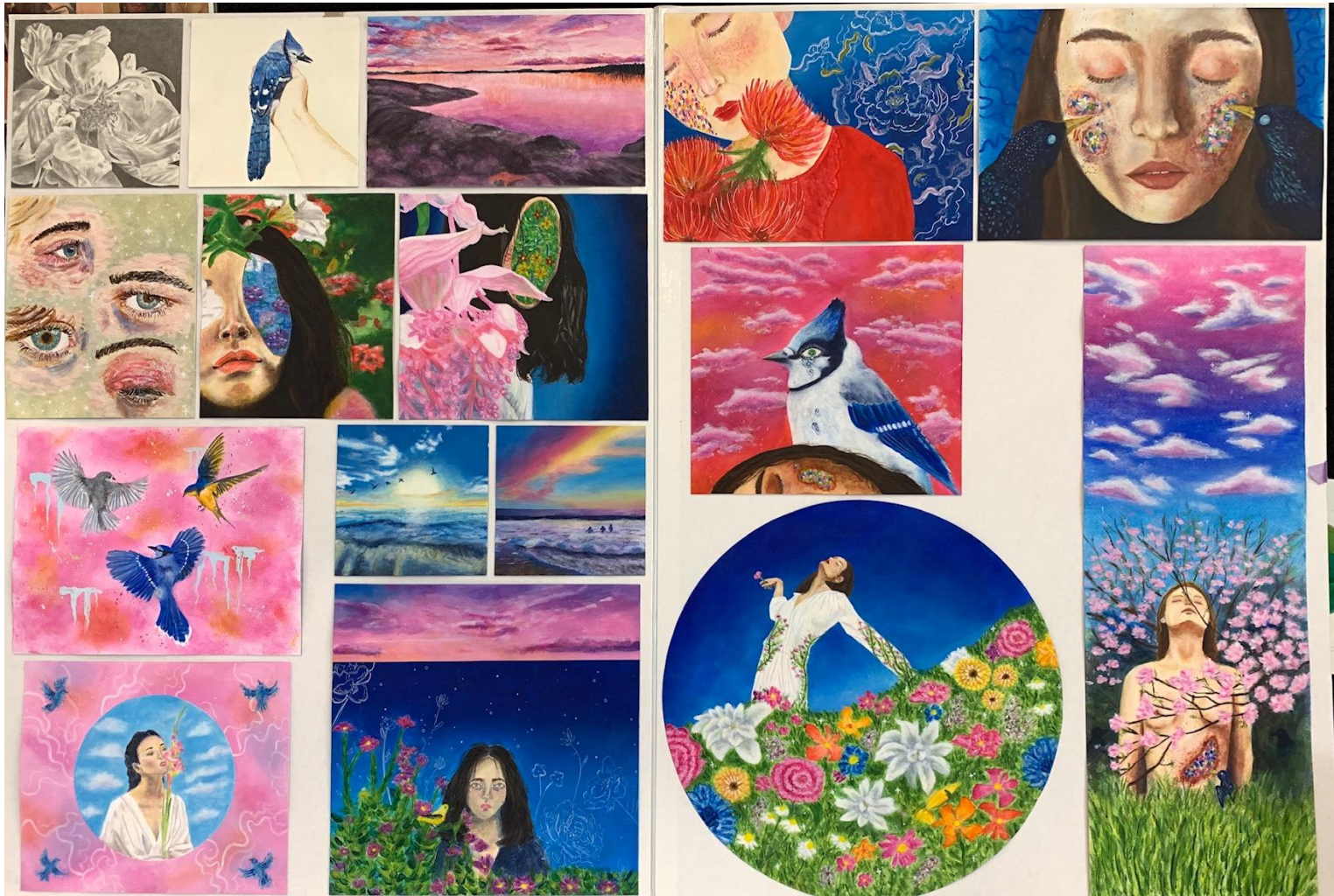
L2 Painting DHS exemplar