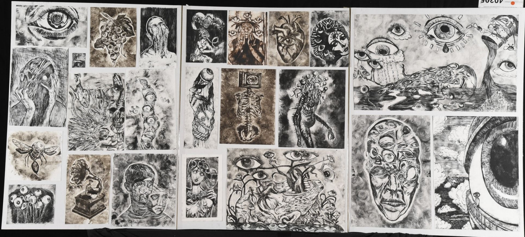
L3 Printmaking Exemplar from NZQA