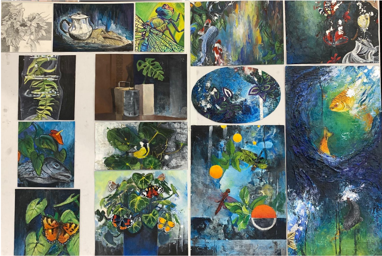
L2 Painting DHS exemplar