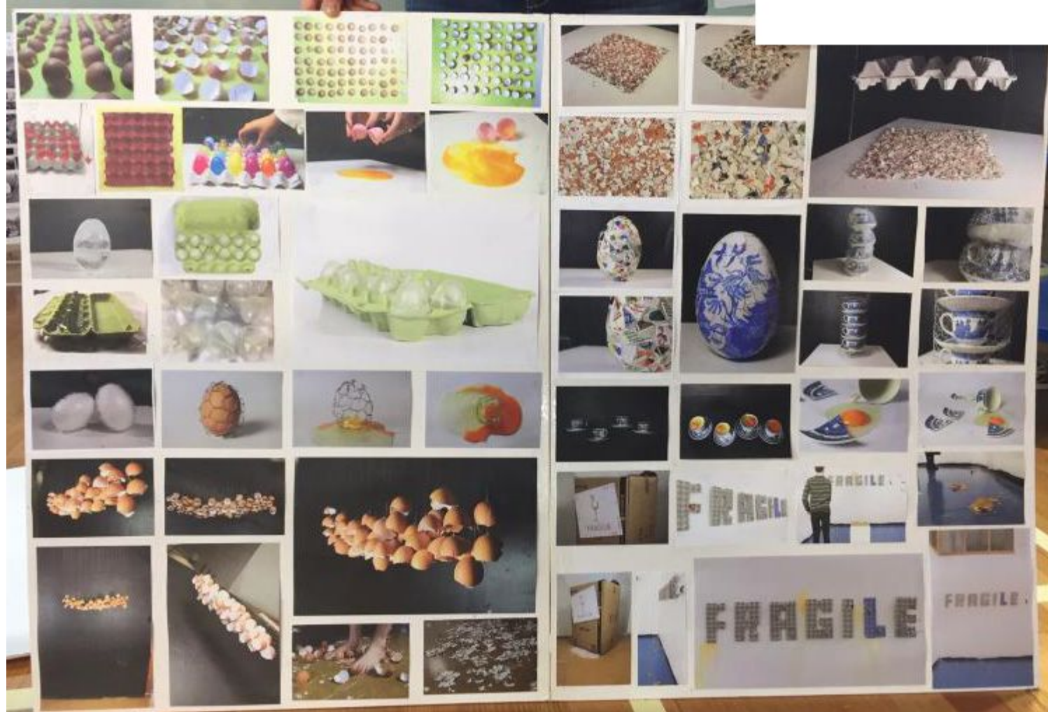
L2 Sculpture folio NZQA example