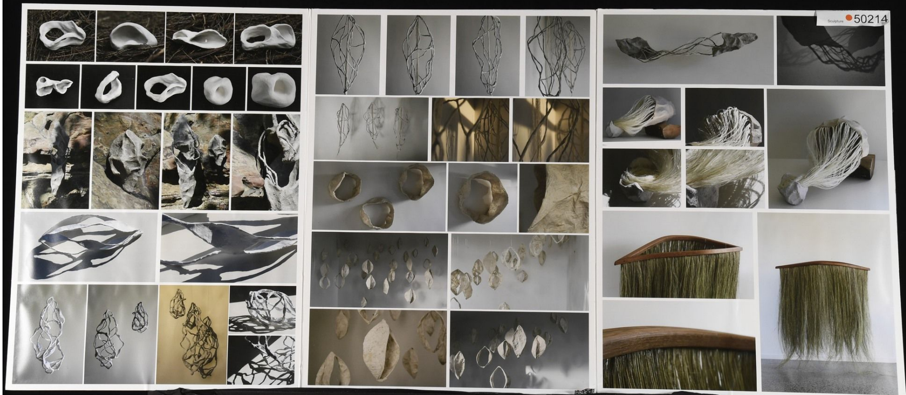
L3 Sculpture NZQA exemplar