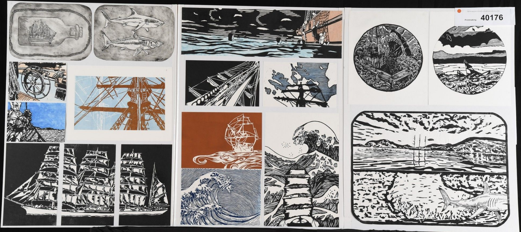
L3 Printmaking Exemplar from NZQA