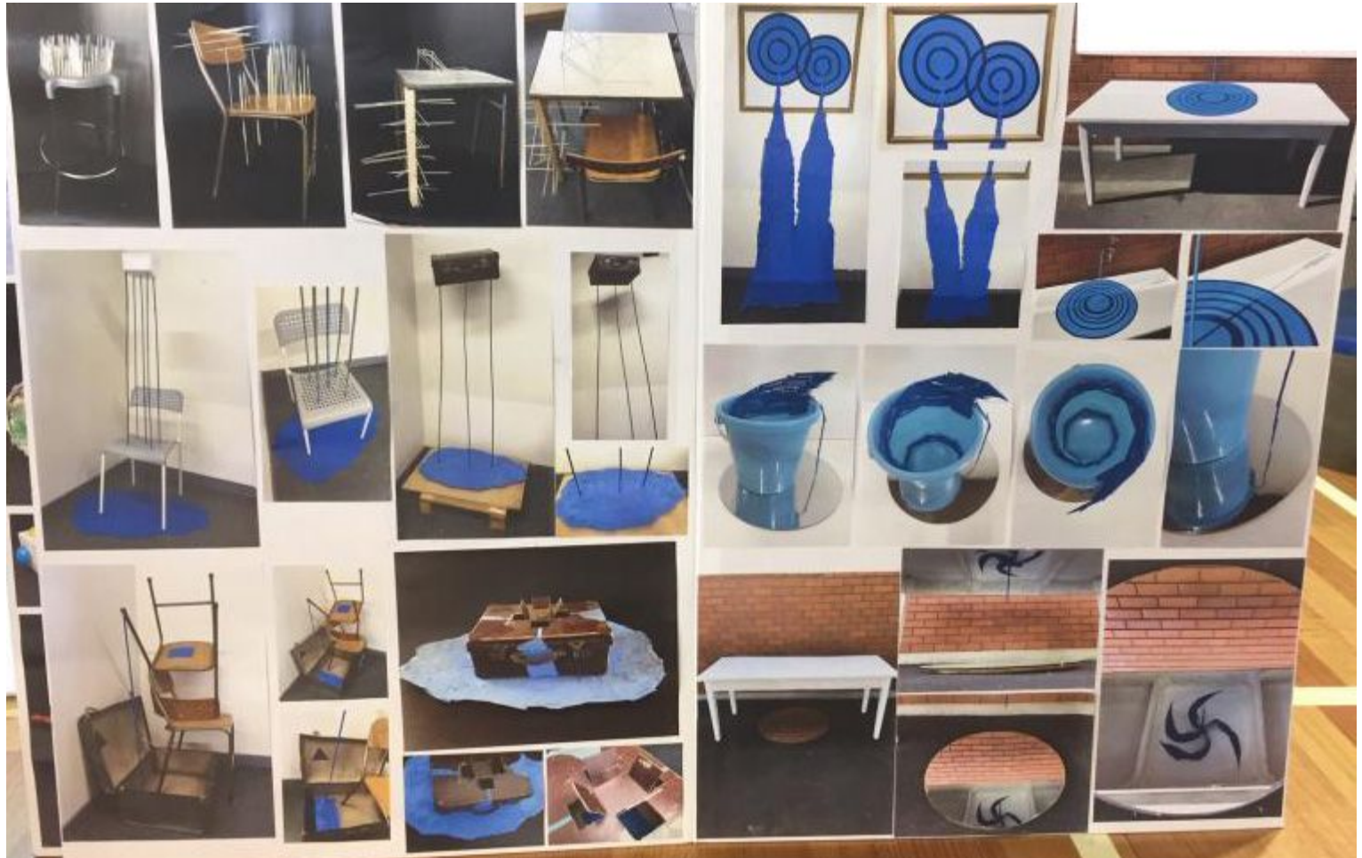
L2 Sculpture folio DHS