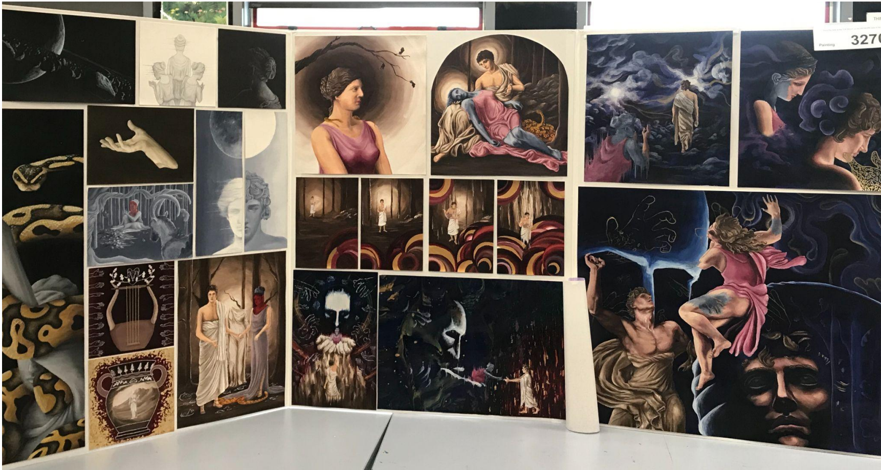
L3 Painting DHS exemplar