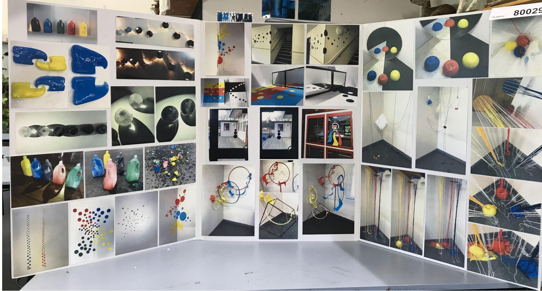
L3 Sculpture DHS exemplar