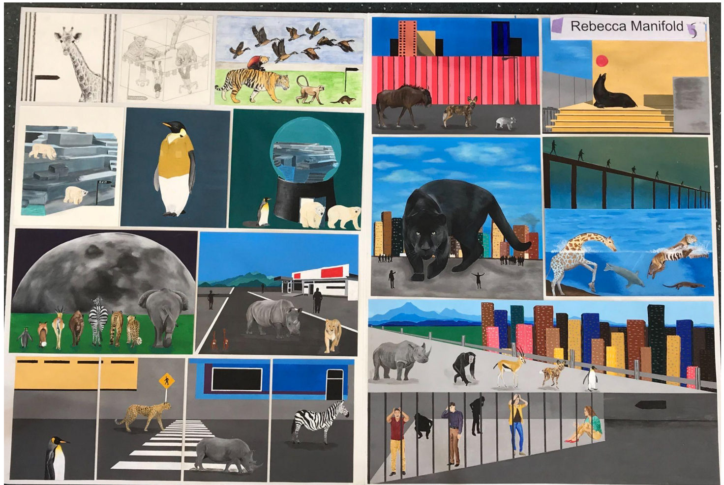
L2 Painting DHS exemplar