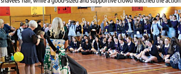
(Pictured above): Part of the crowd of supportive observers in the gym.

Students who donated their profiles went into the draw to shave a strip of shaves' hair, while a good-sized and supportive crowd watched the action.