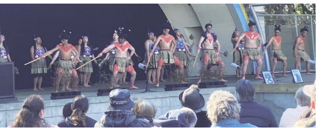
(Pictured above): Kapa Haka boys performing the Haka, Whakatoria and Tika Tonu.

The word is that once the rōpū got on to the stage they just owned their performance. They were strong, confident and showed energy and skill, and an absolute delight to watch, performing well ahead of their ages.