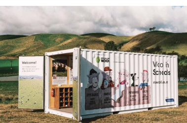
(Pictured above): One of the Woolsheds!

All visitors enjoyed the experience, commenting on many of the lesser-known uses for wool.