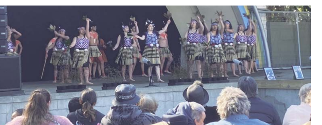
(Pictured above): Kapa Haka girls performing their Waiata-a-ringa, Tūkaha.