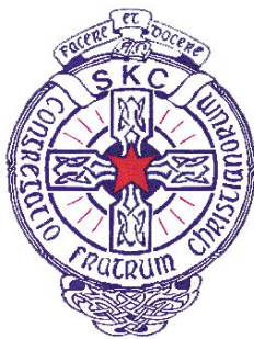
St Kevin's College