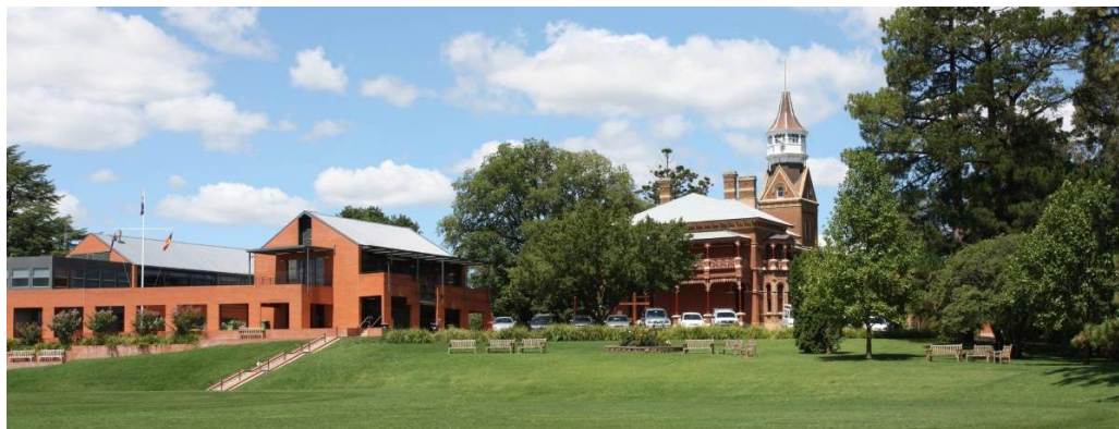
Kinross-Wolaroi School, Orange, Australia

This is an amazing opportunity for these students to experience boarding school life in Australia and New Zealand. Many have returned from these exchanges to find that this had been a real highlight of their time in boarding.