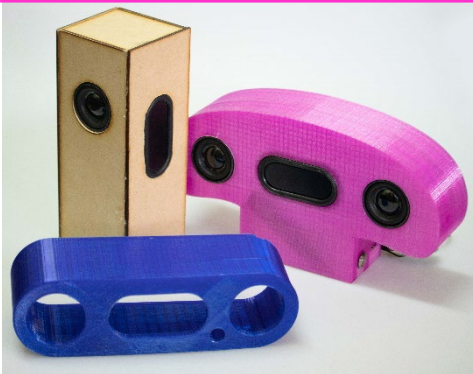
Year 10 Technology 3D print and lasercut Bluetooth Speakers