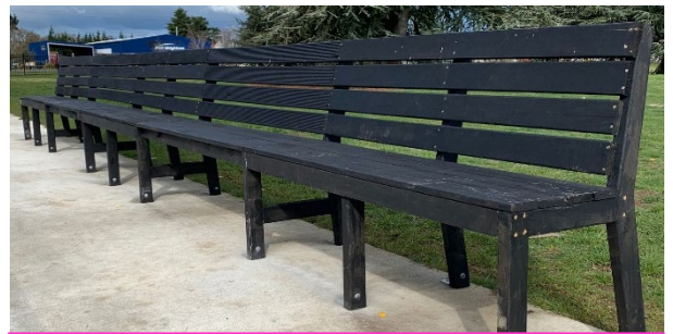
Year 11 Carpentry – Outdoor Furniture range