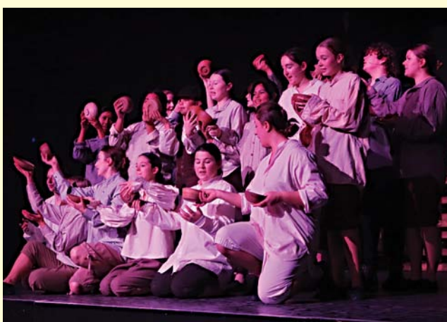
(Pictured above): The Workhouse Kids with their bowls of gruel.

A read through of the recognitions of students and staff will give an idea of the scope and size of the production, and the range of skills required to put together the complete package.