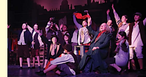
(Pictured above): Fagin with his Gang (You've got to pick a pocket or two!).