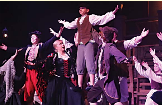
(Pictured above): Workhouse Kids holding newcomer Oliver Twist aloft.