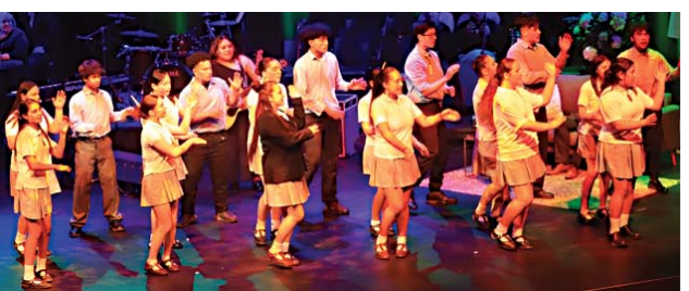
(Pictured above): The College's Kapa Haka Rōpū opening the evening with their performances.