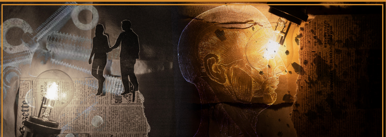
Photography collage, 2022 Kara Easton