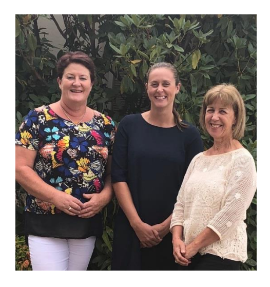
The 2019 Careers Team