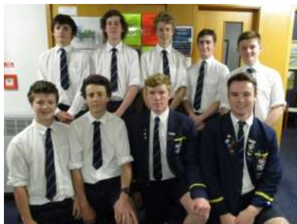
Senior Hostel Prefects 2019