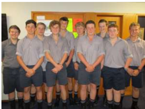
Junior Hostel Prefects 2018

The Junior Prefect team for the rest of this term was named as well as the Senior Prefect Team for 2019. Congratulations to all.