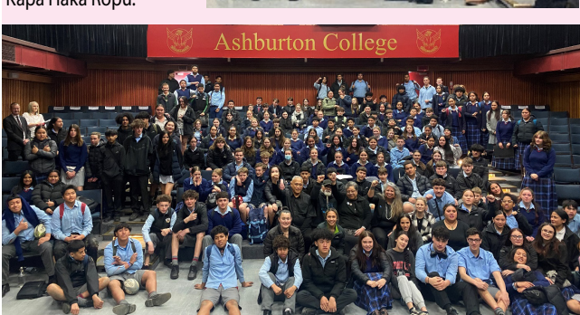
(Pictured above): Students at the presentation.

The presentation linked in well with students' assessments on significant New Zealand events and the Aotearoa New Zealand Histories curriculum.