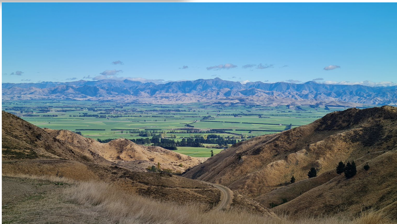
View of the Amuri Basin from the Kaiwara Range

Qualified by I-Car New Zealand under the new standards authority regulations helping get older cars back on the road