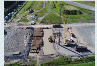
Piling rig in action at Belfast Road