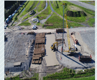
Piling crane in action at Belfast Road