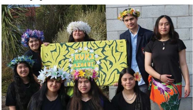
(Pictured above): With their Language Week sign.

To conclude this week-long celebration, all of our Cook Island students dressed up into their cultural attire called 'Tav'. This marked the end of Cook Islands Language Week.