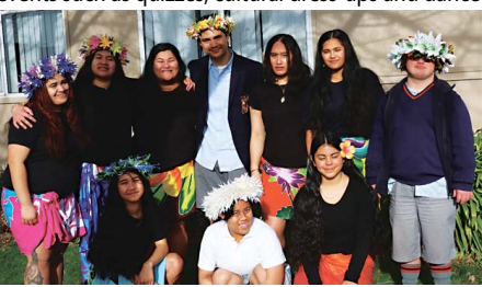
(Pictured left): The group who performed to the students in Te Whare Manaaki.

At Ashburton College, we celebrated this week by hosting small-scale events such as quizzes, cultural dress-ups and dance performances.