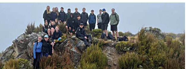
(Pictured above): Students at the top.