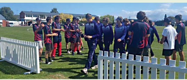
(Pictured above): Ashburton College clapping-off deserving winners, Timaru Boys' High School.