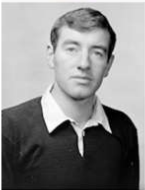
Mains in 1970

Laurie Mains All Blacks Rugby Team, Player and Coach