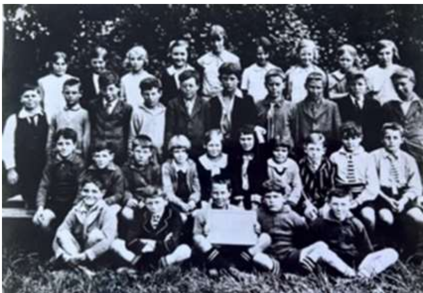
1932 Class photo