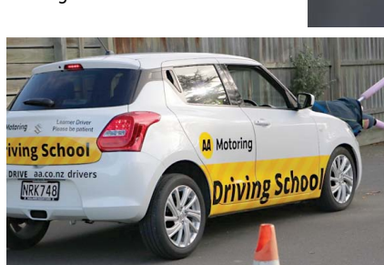
(Pictured above): In this demonstration the stopping time was insufficient to avoid hitting 'the child'.

This workshop provides very visible images of the importance of travelling a safe distance behind a preceding vehicle, and the distance it takes to make an emergency stop in the event of the unexpected, including a child running out in front of a vehicle.