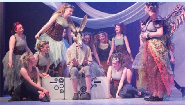
(Pictured above): Donkey Girls - The Sprites entertain Bottom, with songs and dance.