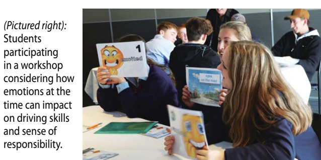
(Pictured right): Students participating in a workshop considering how emotions at the time can impact on driving skills and sense of responsibility.

Facilitators addressed laws, distractions, risk management, social resilience, speed and stopping, peripheral vision, and other critical road safety topics.