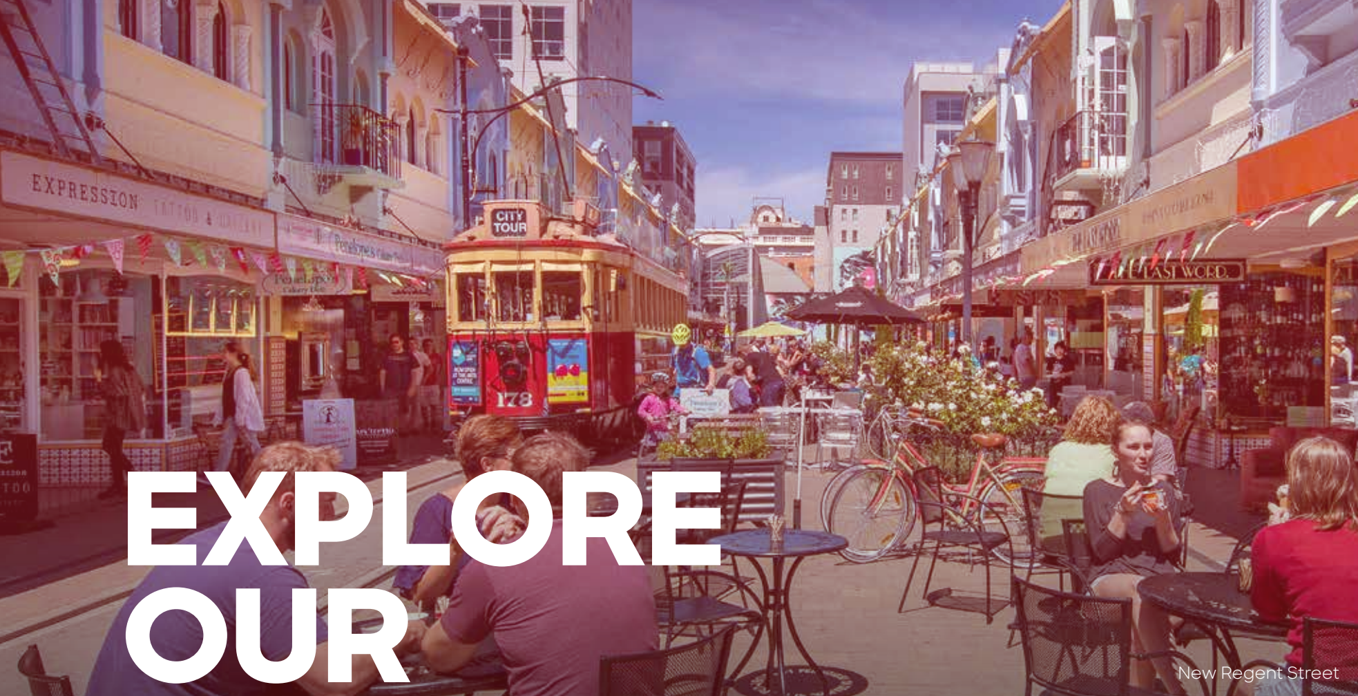
New Regent Street