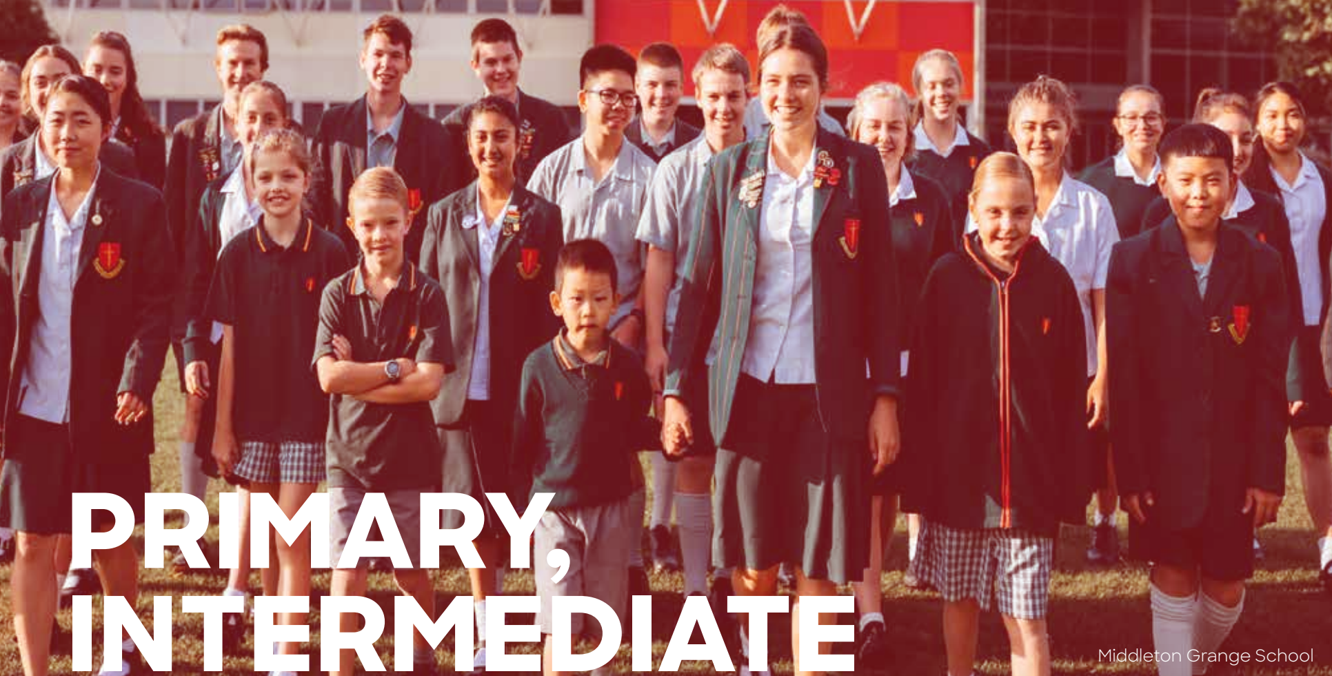
Middleton Grange School