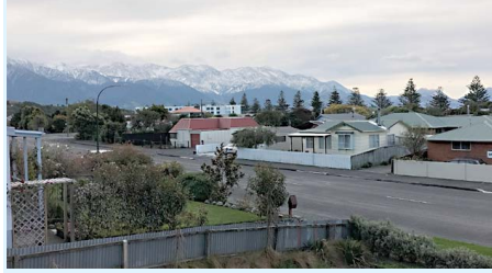
(Pictured left): Snow very low on the Seaward Kaikōura Range.