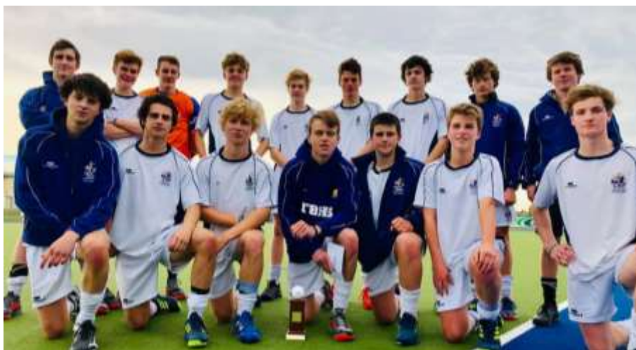
OUR SUCCESSFUL HOCKEY TEAM, POST CBHS EXCHANGE

The 1 st XV fixture in Timaru will be televised on Sky as the 1st XV match of the week.