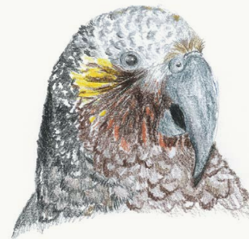
Jasper Fischer 2019 – 2nd place – 13yrs

For students from the Eastern Suburbs of Wellington with a passion for the arts. Visual, music, performing arts – wherever your talent lies a FAB Arts Bursary can help support it.