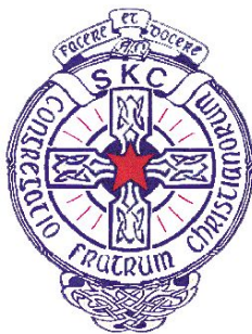
St Kevin's College