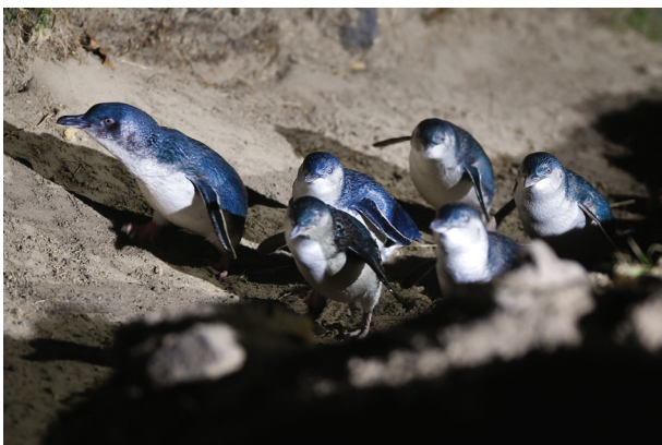
Pukekura Blue Penguins at Taiaroa Head on the Otago Peninsula