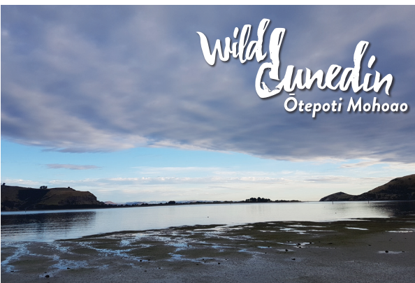
Ornate beach on Otago Harbour in front of Ōtākou Marae. The harbour channel in the foreground is called Ōtākou which is how we got the name Otago.