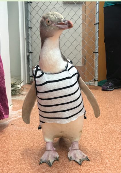
The penguin is in a onesie to prevent itself from plucking the feathers around a healing wound, the idea came after other methods failed.

Bring your favourite toy animal and learn how to bandage injuries with the team from the Dunedin Wildlife Hospital. Find out what goes on behind the scenes when it comes to receiving, treating and rehabilitating some of New Zealand's most treasured species. Cost: FREE