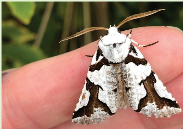
Aihuka (Declana egregia) the South Island zebra or lichen moth.