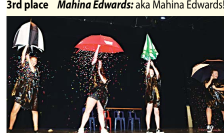
(Pictured left): Senior Section winners 'Weather Girls'.