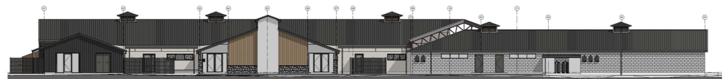
South elevation of the proposed new facility