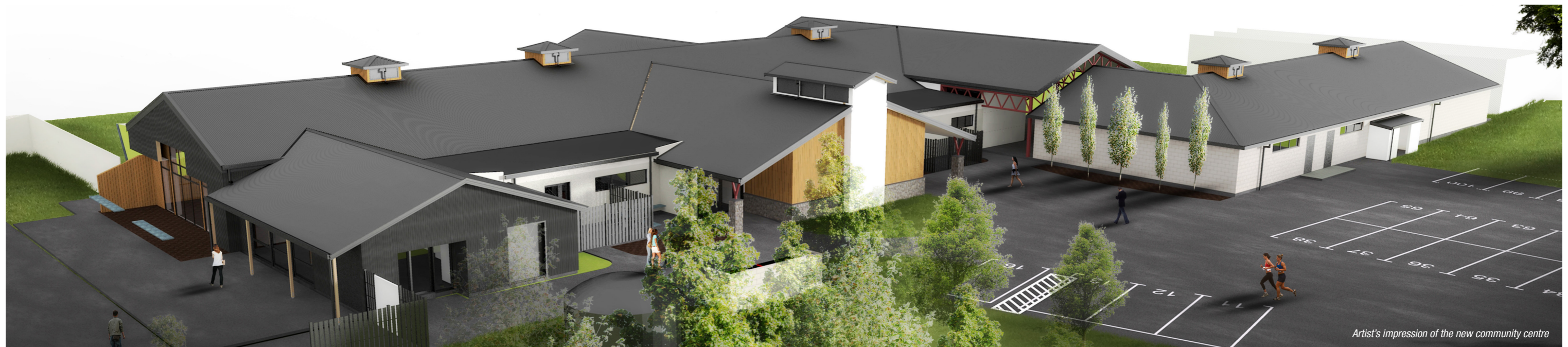
Artist's impression of the new community centre

* Proposed floor plan concept could be subject to change depending on the levels of funding raised.