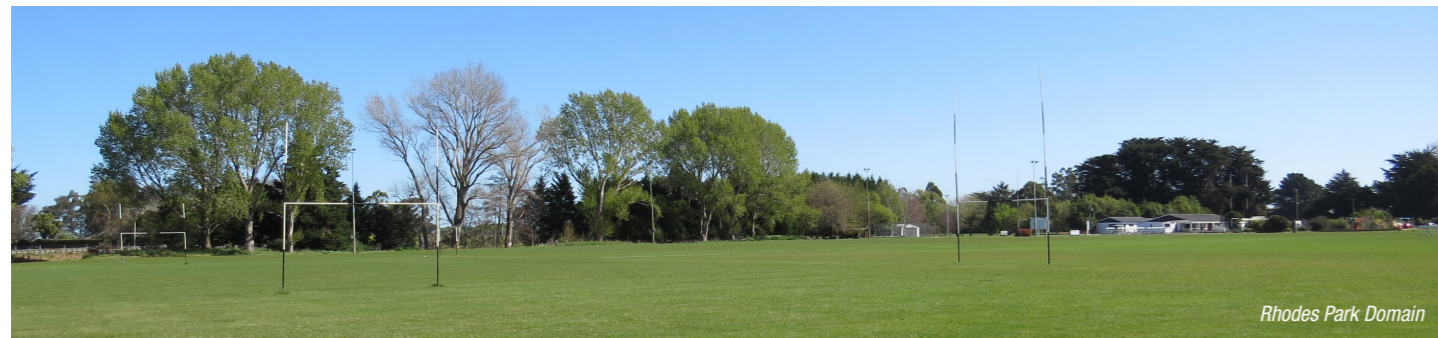
Rhodes Park Domain

The old community hall was demolished in late 2016, and construction of the new facility at Rhodes Park is now under way.