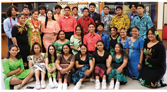
(Pictured above): Students in the Auditorium Foyer, wearing their cultural clothing.

At interval, they proudly sang (and beautifully sang) a Samoan song 'Ua Fa'afetai' as a show of pride and appreciation for their heritage, thus concluding the week-long celebration.