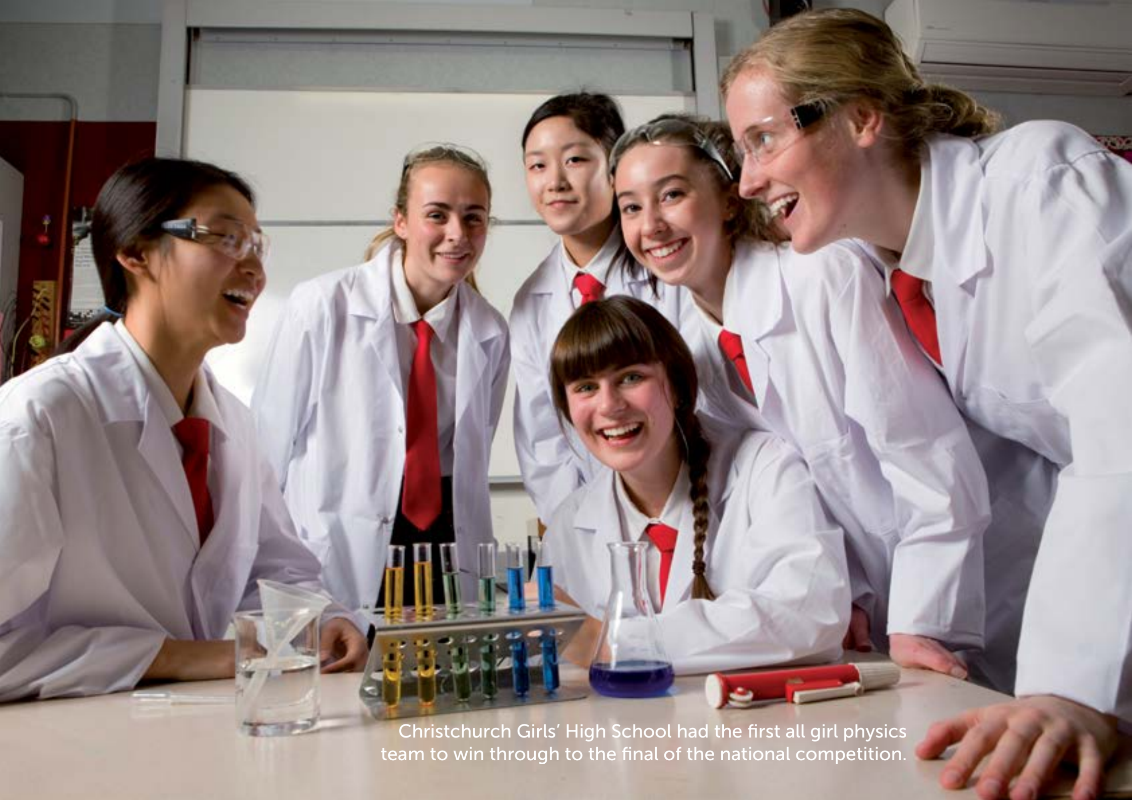
Christchurch Girls' High School had the first all girl physics team to win through to the final of the national competition.