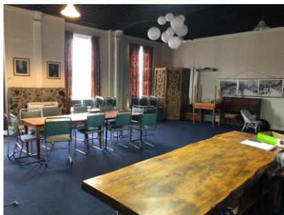
COFFEE LOUNGE / MEETING SPACE