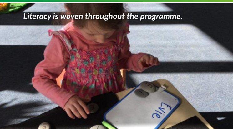
Literacy is woven throughout the programme.

We care for our environment, resources, local and wider community