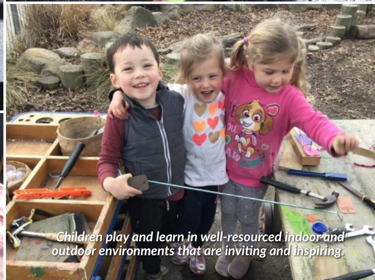
Children play and learn in well-resourced indoor and outdoor environments that are inviting and inspiring.