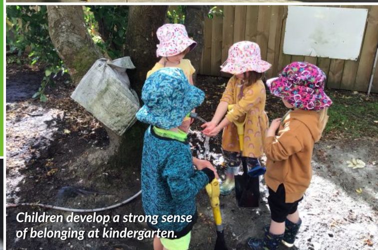
Children develop a strong sense of belonging at kindergarten.