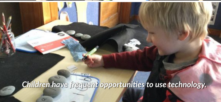
Children have frequent opportunities to use technology.