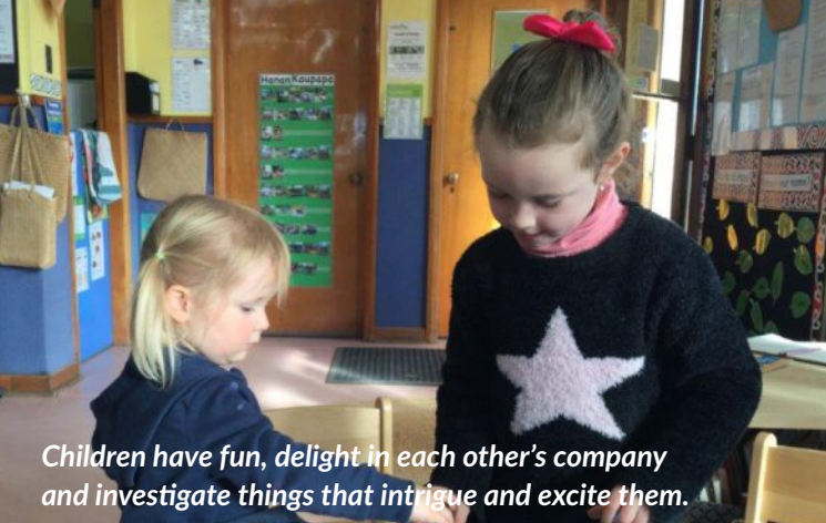
Children have fun, delight in each other's company and investigate things that intrigue and excite them.