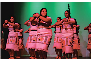
(Pictured left): A section of the Tongan Girls in their performance.