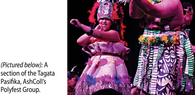
(Pictured below): A section of the Tagata Pasifika, AshColl's Polyfest Group .