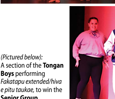
(Pictured below): A section of the Tongan Boys performing Fakatapu extended/hiva e pitu taukae , to win the Senior Group .