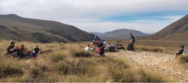
(Pictured above): Students enjoying the views while having lunch on the return journey.

The next day it was pack up after breakfast and head back on the return journey, with day two being slightly easier in the sense of it being mostly downhill.