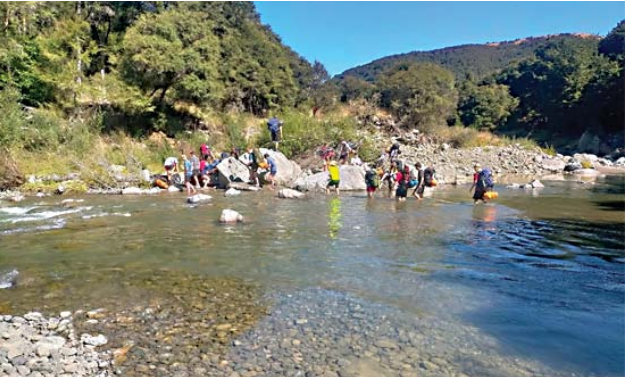
(Pictured above): Students crossing the river at the start of the hike.

The hike is made up of a gradual climb beside the Okuku River, and only steep in a few places where there had been washouts. These made for a few tricky parts to navigate through. After several hours the group made it to the destination, where they were greeted with beautiful surroundings, a flowing stream down to the river, with a spot to have a dip, and the standard backcountry long drop.