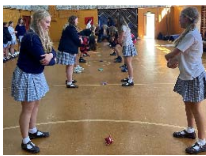
(Pictured right front, left and right): Isla Hart and Paige Hart in a STEP principle exercise.

Without these amazing volunteers, sport would look vastly different and, at College, we very much value their contribution.