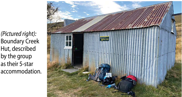
(Pictured right): Boundary Creek Hut, described by the group as their 5-star accommodation.

All students were using tents as part of their practice in carrying all their gear. After setting up, the late afternoon was available for those who were keen to have a bit of an explore around the area or sit and relax their aching muscles in the stream.