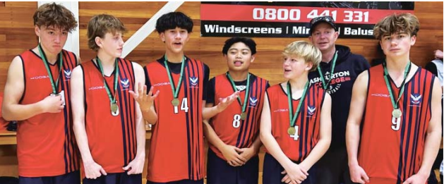
The Victorious A Grade Aoraki Junior Boys' Championship Winners: AshColl 1 Team