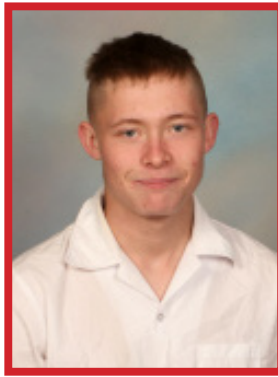
Phoenix Jimmink Basketball