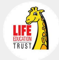
Life Education Trust

Supporting the Kiwi Kids programme to help provide essentials that local children would otherwise go without.