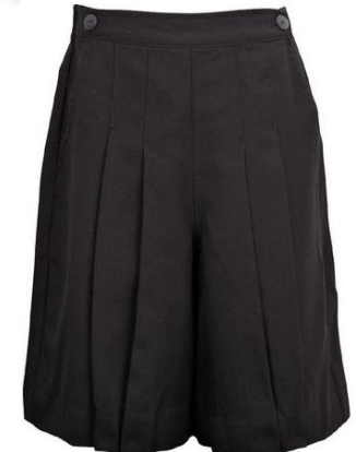
Parkview Parua School Uniform items