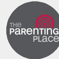
The Parenting Place

Supporting Womens refuge in educating young people to become more confident, more assertive and aware of how to deal with family violence.