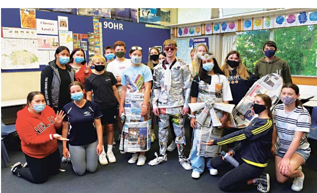
(Pictured above): Students who had practised making clothing from newspapers, in preparation for facilitating the same group activity with the Year 9 students.