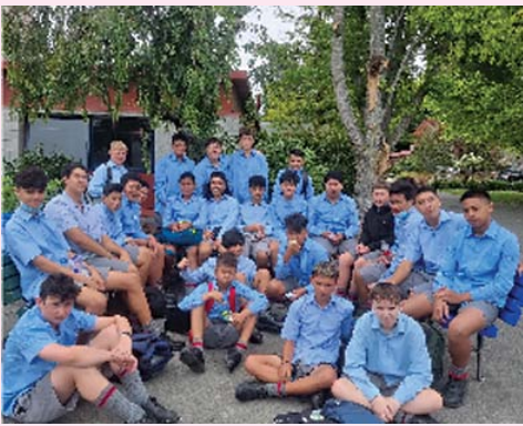
(Pictured left): A group of Year 9 boys enjoying an outside break during the day.