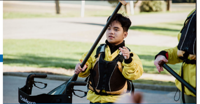
Outward Bound Adapted Courses