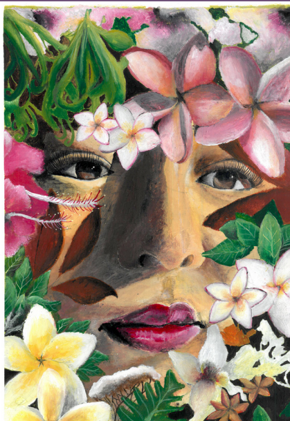
by Catherine Paragas