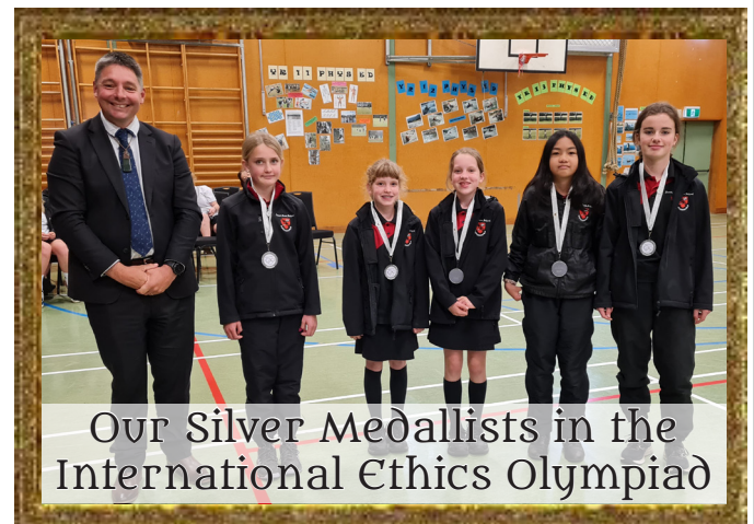
Our Silver Medallists in the International Ethics Olympiad