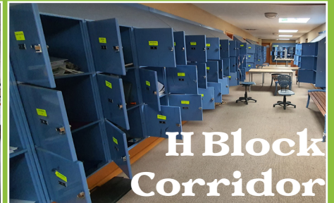
H Block Corridor