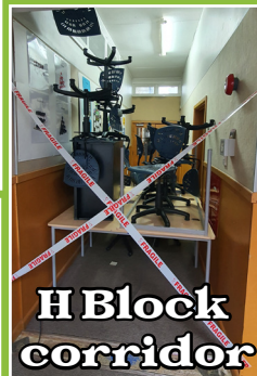
H Block corridor