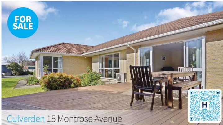
Culverden 15 Montrose Avenue