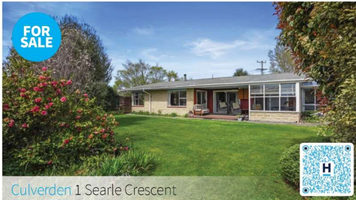
Culverden 1 Searle Crescent