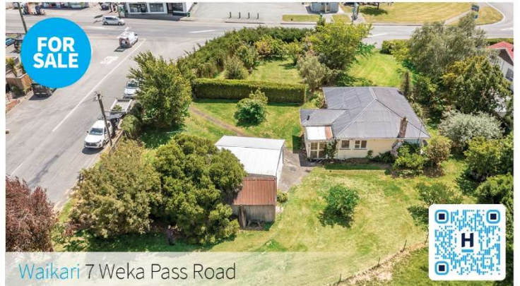
Waikari 7 Weka Pass Road