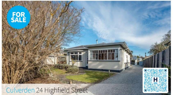
Culverden 24 Highfield Street