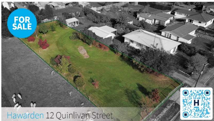
Hawarden 12 Quinlivan Street