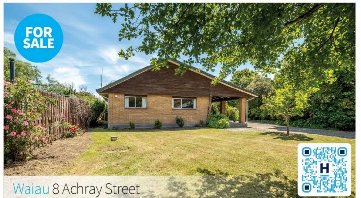
Waiau 8 Achray Street