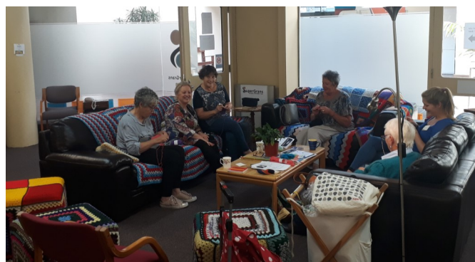
Crafty Pop In - every Friday 10-2pm at SuperGrans Place

Thank you to all of our wonderful volunteers and supporters. Without you we wouldn't be able to do what we do!