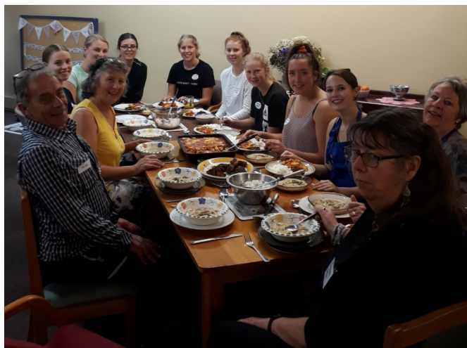
A lovely meal after a flatting cooking workshop with Otago Polytechnic Occupational Therapy Students in March

24th of July—Single Use Plastic Free Lunches / Lunchbox Ideas - 7 - 9pm } Booking is essential