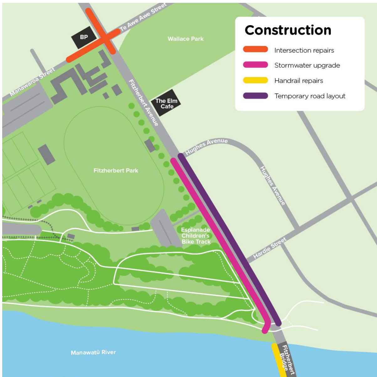
This map shows the worksites and extent of the new road layout.