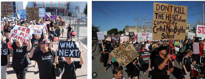
Protesting against school closures