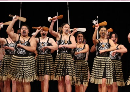
TE AO MĀORI