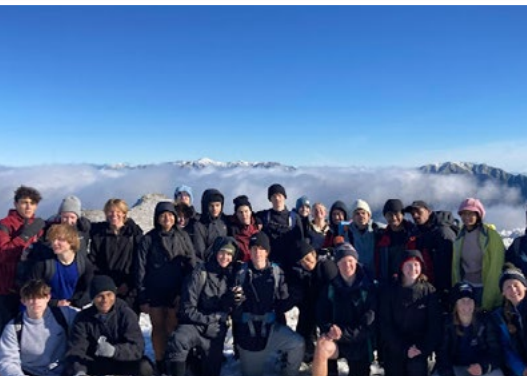
HEALTH & PHYSICAL EDUCATION