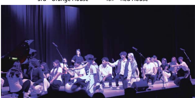
(Pictured above): In the always hotly contested House Fest part of Music Evening, winning Blue House going through part of their routine.